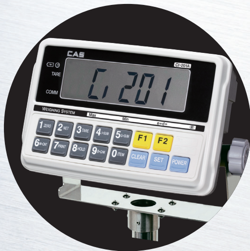
▲ CI-201A with optional pole bracket

Applicable for various weighing applications, with the added flexibility of manually setting functions via numeric keys. With various power supply options, the CI-200A series is highly portable and ideal for environments where power outlets are not available or power outages often occur.