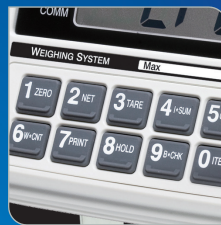
Numeric & function keys