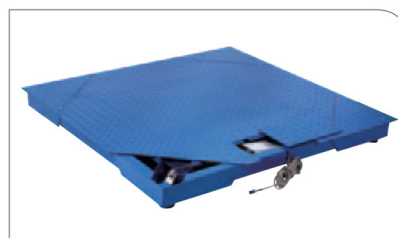
Easy Open From Top. Easy Calibration(Optional)