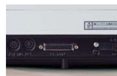
Data transfer port of AW/AX/AY Series